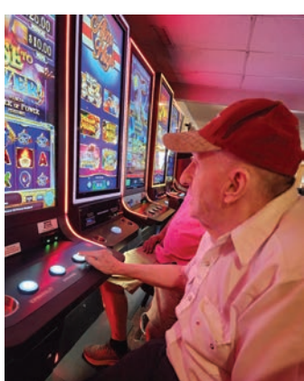
LEFT: We periodically take residents on field trips to visit familiar places in the area. In June, residents took a trip to the Pheasant Cafe in Mott, where they enjoyed a great meal and took part in some entertainment. Our residents always enjoy these trips, and we have more planned this summer!