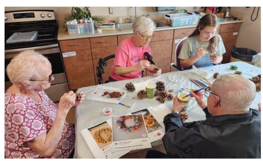
Residents use their artistic talents during craft time at Richardton Health Center. In June, we painted pine cones to create some colorful decorations!